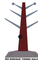
IES ENRIQUE TIERNO GALVÁN